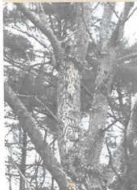
EAB-damaged Ash Tree

Learn about EAB at http://bit.ly/2GX98nG