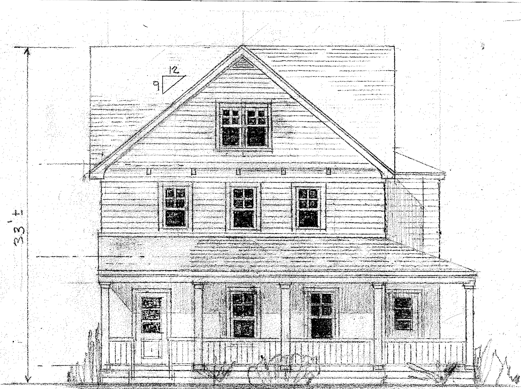
FRONT ELEVATION \frac{3}{16} = 1'-0" 10 TH AVE.