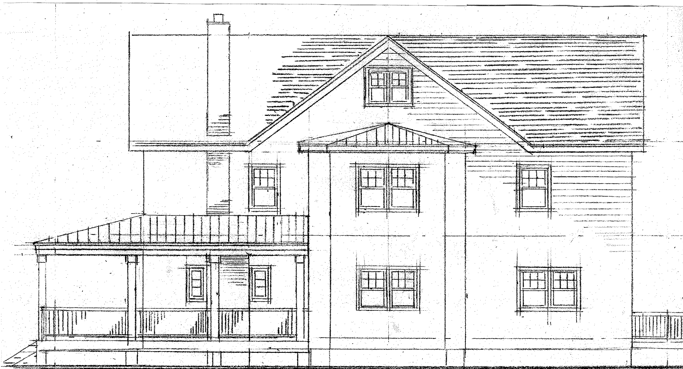
RIGHT SIDE ELEVATION (C STREET) \frac{3}{16} = 1'-0"